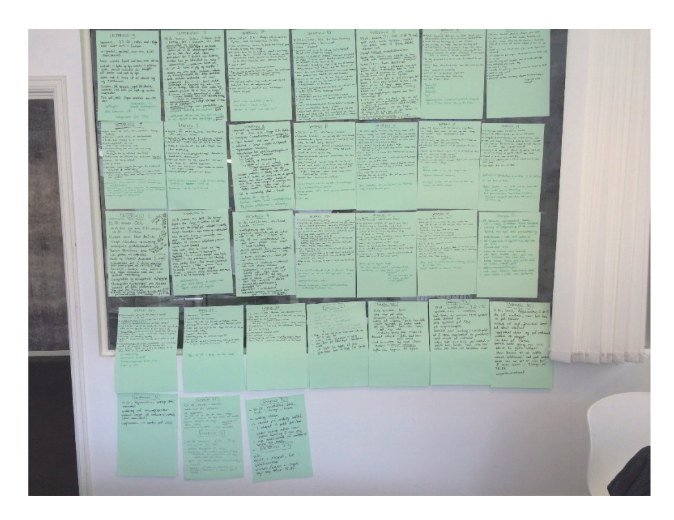
Figure 1: We've reviewed the interviews, written down keywords, and put sheets on the wall.

An important point regarding reviewing the data, is that we don't invite comments and discussions at this stage. This is important for two reasons: firstly, we risk running out of time for the next steps of the analysis and not finishing within the time frame. Secondly, sticking closely to the empirical material will be an advantage and getting a total overview of the data before discussing it. So, at the beginning of the meeting we start reviewing right away.