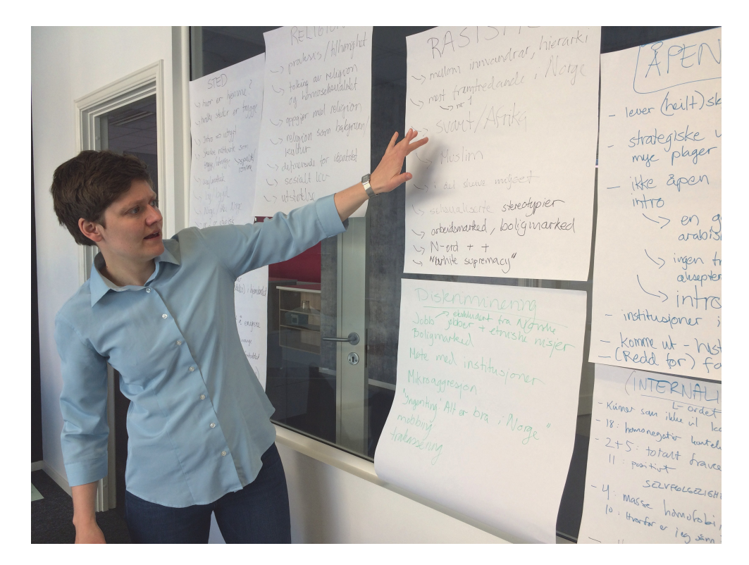
Figure 3: The author at work during the theme grouping (step 3).

We grouped together isolation/loneliness, love/partnerships, family, and social networks because the main theme for all of these is relationships. Encounters with institutions, the law, disappointment with Norway, we grouped together because the disappointment that several informants expressed centres around laws and regulations and how they were met at different institutions. Sexual abuse and health were grouped together, because abuse to a great extent leads to health problems. Racism, discrimination, homophobia, and living openly or closeted/stealth as queer were grouped together because they are about the two dimensions of discrimination that form the focus of this project: migrant background on the one hand, and gender and sexual orientation on the other. Experiences of migration and stories of places were grouped together. We chose to place religion as a sub point within several of the other groups of themes.