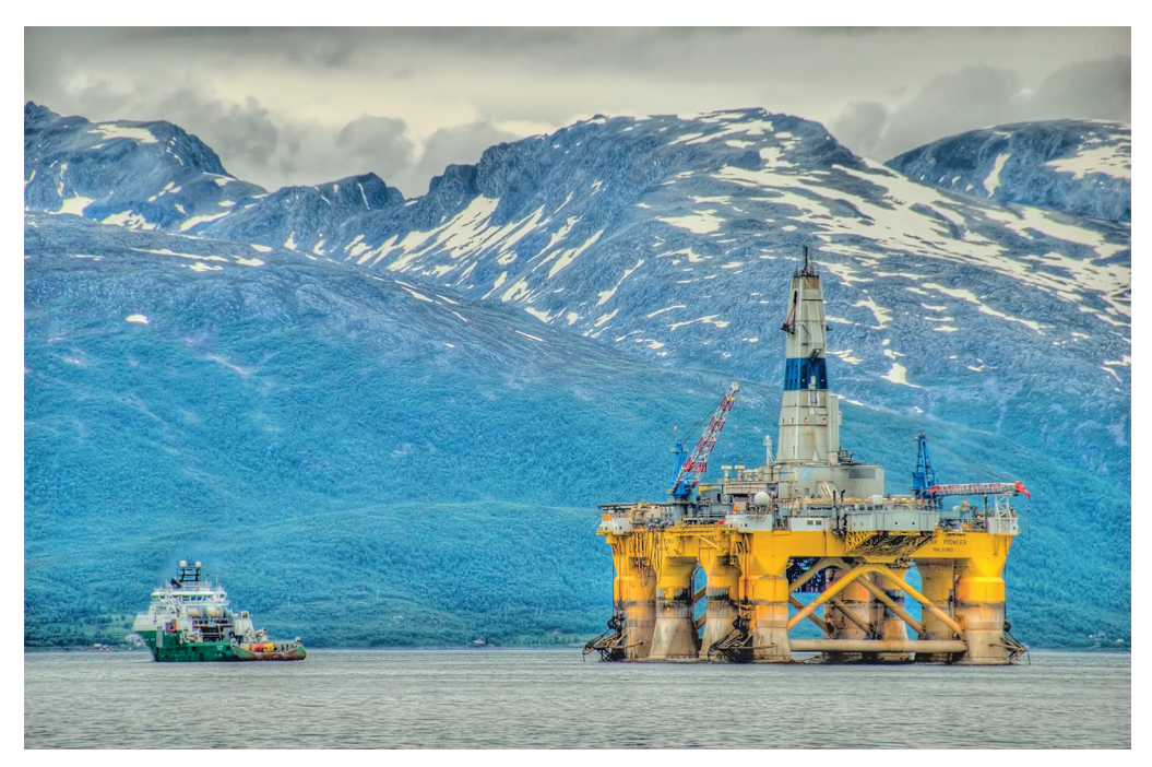
(Illustration 1. The Polar Pioneer, symbolically yellow as a Canary bird – both a materialization of the idea of a petroleum-driven perception of Arctic futures and a symbol of the heightened risk associated with large-scale investment in extractive projects in the region. (Photo: Per Ivar Somby, 2011. Used with permission).

northward.<sup>11</sup> The underlying narrative here is clear: get there first or miss the final opportunity to exploit large, new areas for drilling on the Norwegian shelf; in other words, a race to the bottom where arguments concerning Norway's ability to secure so-called green oil to the world and natural gas to our European allies took center stage.